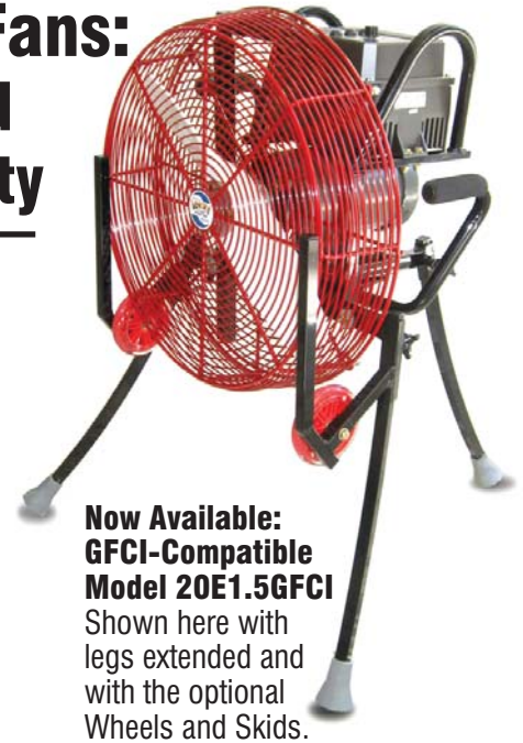
Now Available: GFCI-Compatible Model 20E1.5GFCI Shown here with legs extended and with the optional Wheels and Skids.

*Thrust is a measure of fan performance that allows for easy comparison between fans.