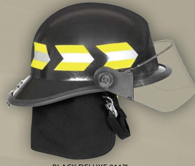
BLACK DELUXE 911™ with 4" visor

911 STANDARD FEATURES Black NOMEX® with FR Fleece Lining Ear Cover 3M Solid Lime Yellow Reflective Strip Trim Knit sweatband and nape