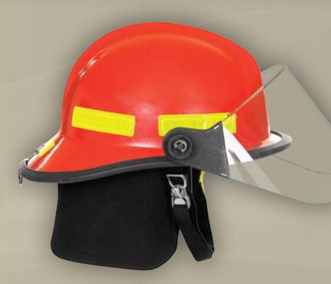
RED STANDARD 911™ with 6" visor

911 STANDARD FEATURES Black NOMEX® with FR Fleece Lining Ear Cover 3M Solid Lime Yellow Reflective Strip Trim Knit sweatband and nape