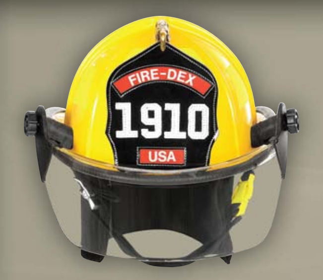
YELLOW STANDARD 1910™ with 4" visor

1910 STANDARD FEATURES Black NOMEX® with FR Fleece Lining Ear Cover 3M Scotchlite Solid Lime Yellow Trapezoid Trim Knit sweatband and nape