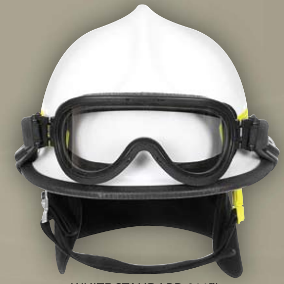
WHITE STANDARD 911™ with goggles

911 DELUXE FEATURES Black NOMEX® / KEVLAR® with FR Fleece Lining Ear Cover 3M Triple Trim Chevrons Leather sweatband and nape