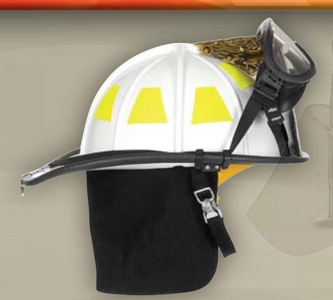
WHITE STANDARD 1910™ with goggles

1910 DELUXE FEATURES Black NOMEX° / KEVLAR° with FR Fleece Lining Ear Cover 3M Triple Trim Trapezoid Leather sweatband and nape